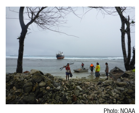
Local partners complete another day of preparation for removal efforts.

Tourists from the cruise ship Marina enjoying the cultural performance from the Fa'asao Marist High School dance troupe.