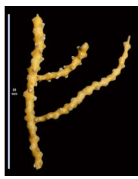
The first specimen, or holotype, of Chromoplexaura cordellbankensis was collected in 2018.