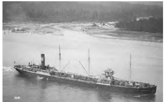
Montebello underway

Did you know that within the boundaries of the proposed sanctuary lie the remains of the oil tanker Montebello? The 1921 tanker, carrying over three million gallons of crude oil, was sunk by a single torpedo fired by a Japanese submarine during World War II in December 1941, just two weeks after the attack on Pearl Harbor. The Montebello sits in 900 feet of water approximately seven miles southwest of Cambria. ONMS has led or participated in two missions to the shipwreck,