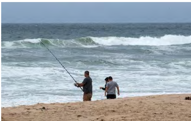
A Family Fishing from Shore

Do you have any amazing photos from your visits to national marine sanctuaries? Learn more about the photo contest and submit your photos for consideration by Sept. 5. Winning photos will be announced in October.