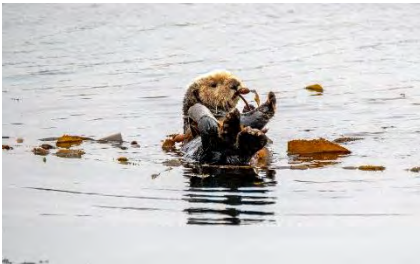
Sea Otter at Morro Bay Harbor