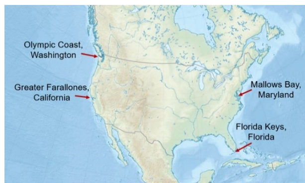
Locations of two West Coast and two East Coast sanctuaries; more at https://sanctuaries.noaa.gov .