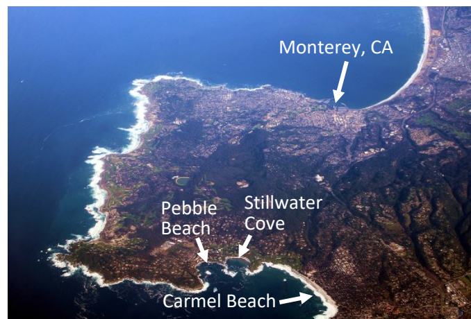
Monterey Bay peninsula in 2020; Adapted from Photo by Coolcaesar CC BY-SA 4.0

Article courtesy California Digital Newspaper Collection, Center for Bibliographic Studies and Research, University of California, Riverside: http://cdnc.ucr.edu