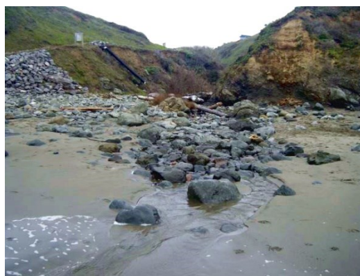
Pinnacle Gulch, Greater Farallones National Marine Sanctuary in May 2010 (left) and January 2011 (right)