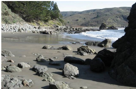
Muir Beach in August 2010 (left), January 2011 (right): Where is there increased erosion and exposure of rocks?