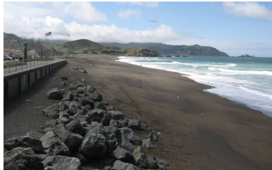
Sharp Park, July 2010 (left) and May 2011 (right). Where is there more deposition of sand?