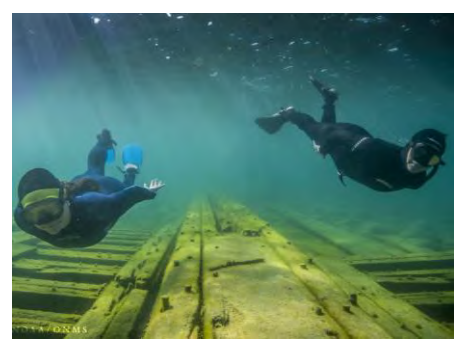
The sanctuary's historic shipwrecks are open to snorkeling, diving, boating, and other recreational activities