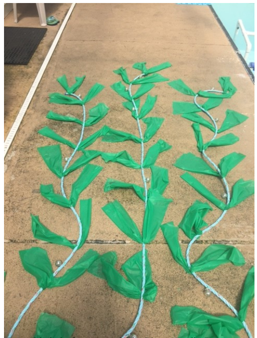
Reusable kelp forest– poolside.

Materials: scissors, green plastic table cloth, twisted polypropylene rope, fishing floats (or used Christmas ornaments), dive weights, reusable zip ties