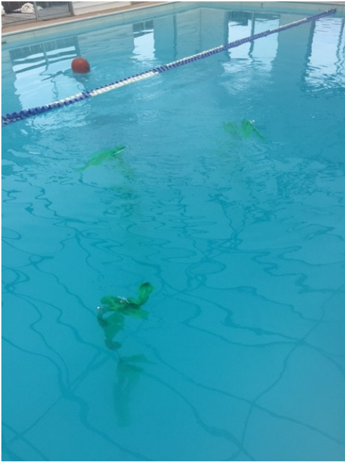
Reusable kelp forest– in water.