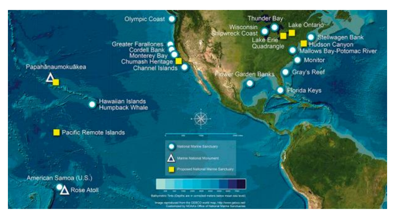
A map of the National Marine Sanctuary System in the U.S. and its territories.