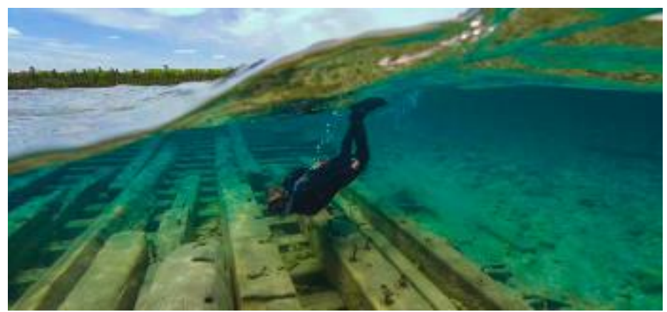
A scuba diver explores a shipwreck in Thunder Bay National Marine Sanctuary.