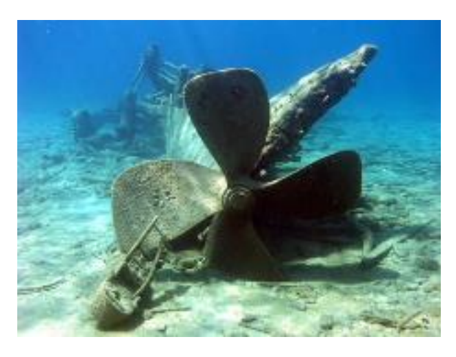
The propellor of a shipwreck in Thunder Bay National Marine Sanctuary.

Located in northwestern Lake Huron, Thunder Bay is adjacent to one of the most treacherous stretches of water within the Great Lakes system. Unpredictable weather, murky fog banks, sudden gales, and rocky shoals earned the area the name "Shipwreck Alley." Today, the 4300-square-mile Thunder Bay National Marine Sanctuary protects one of America's best-preserved and nationally-significant collections of shipwrecks. Fire, ice, collisions, and storms have claimed over 200 vessels in and around Thunder Bay. To date, nearly 100 shipwrecks have been discovered within the sanctuary. Although the sheer number of shipwrecks is impressive, it is the range of vessel types located in the sanctuary that makes the collection nationally significant. From an 1844 sidewheel