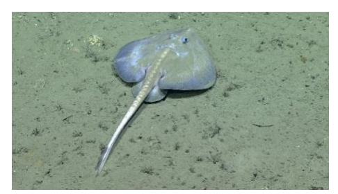
A skate was seen while diving in Hudson Canyon during a NOAA expedition in 2021.

The waters surrounding Hudson Canyon also hold historical and cultural