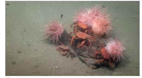
Sea anemones and crabs can be found along the seafloor in Hudson Canyon.

A national marine sanctuary in this area could complement other resource management efforts by raising awareness. supporting research, and guiding coordinated and comprehensive ecosystembased management.