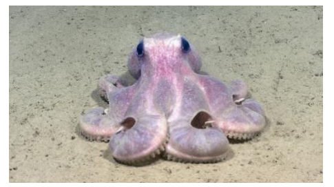
This small octopus was seen by an ROV from the NOAA Ship Okeanos Explorer.