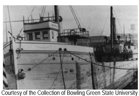
The wreck of the steamer David W. Mills lies within the proposed sanctuary.