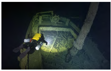
A diver explores the stern of Queen of the Lakes , which remains upright and intact.