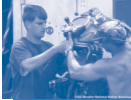
Navy divers use specialized diving equipment such as the mK-21 MOD 1 Diving Helmet. This helmet is used for deep water and salvage diving.

Additional information about the Monitor and the mission can be found at www.sanctuaries.nos.noaa.gov and www.monitorcenter.org .