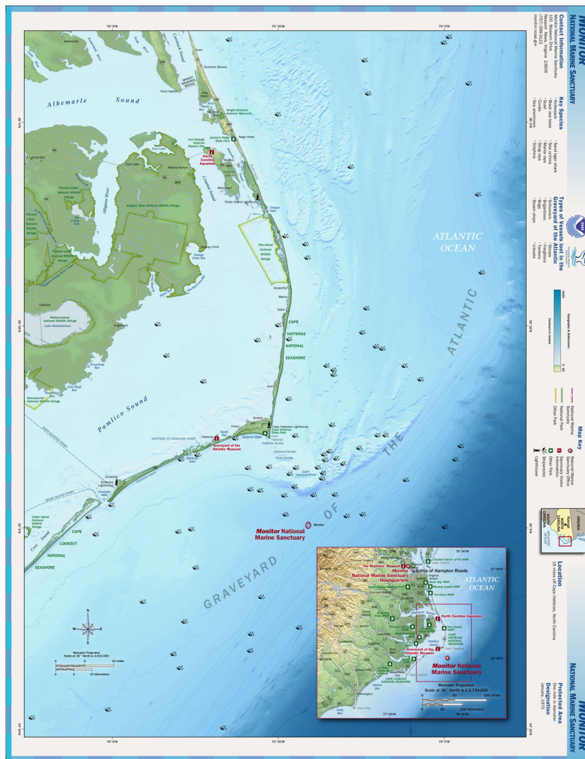
Sanctuary maps available at sanctuaries.noaa.gov