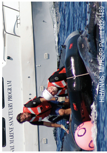
HIHWNMS, MMS SRP Permit: 992-1489