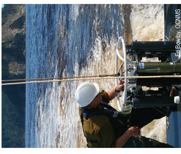
Ed Bowiby, OCNMS

Intensive plankton blooms off the Oregon and Washington coast in the fall of 2009 resulted in the deaths of over 6,000 seabirds. The organism, Akashiwo sanguinea , produces chemicals that strip oil from seabird feathers, causing death by hypothermia. As a result, the sanctuary and its partner agencies mobilized a cooperative effort to quickly assess – and respond to – similar “natural” events that require the rapid action of teams of biologists, oceanographers and other experts. Fearing a repeat of the previous year’s “seabird wreck,” the teams reacted quickly when white winged and surf scoters that normally remain at sea started appearing on beaches. Fortunately, this year’s event proved minor. However, prepared for the worst, the ongoing cooperation, aided with good planning and communication proved a major improvement in understanding and responding to dynamic events in the marine environment.