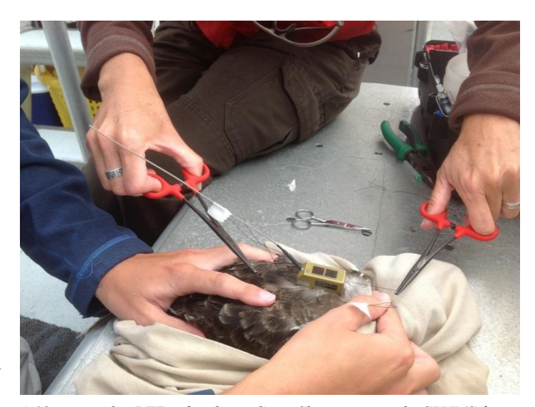
A 12 gram solar PTT is fitted to a Great Shearwater in the SBNMS for identifying patterns of habitat use.