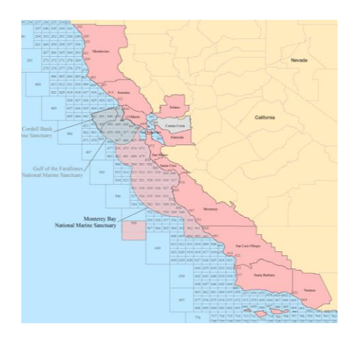
Map: Tony Reve

Map of MBNMS, California Department of Fish and Wildlife blocks and counties in the study area.